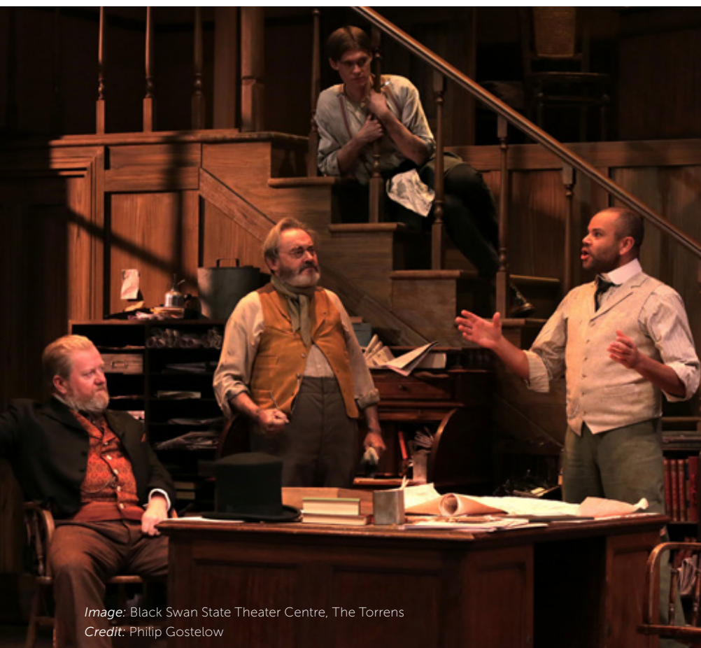
Image: Black Swan State Theater Centre, The Torrens