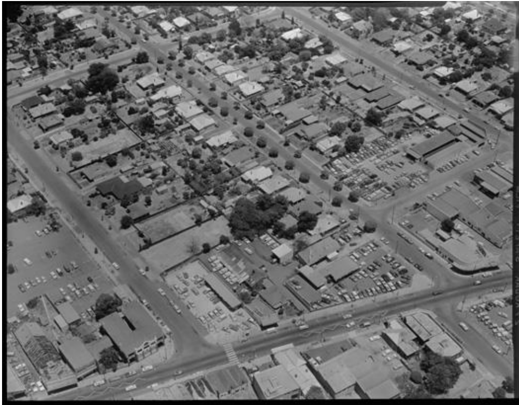
State Library of Western Australia