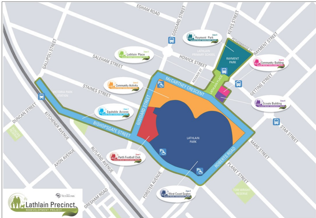
Figure 1 – Lathlain Precinct Redevelopment Project Zones