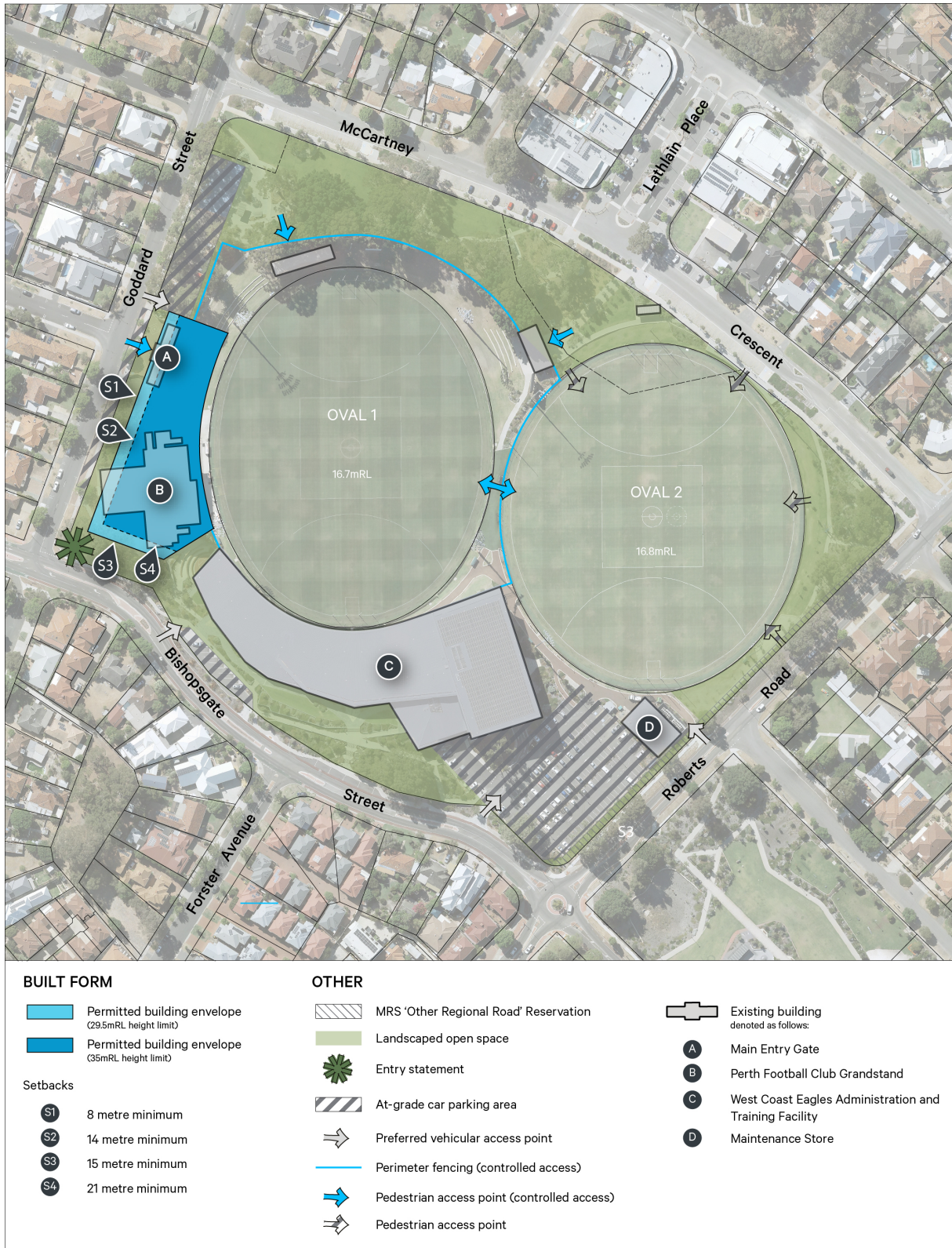
Figure 3 – Key Principles Plan