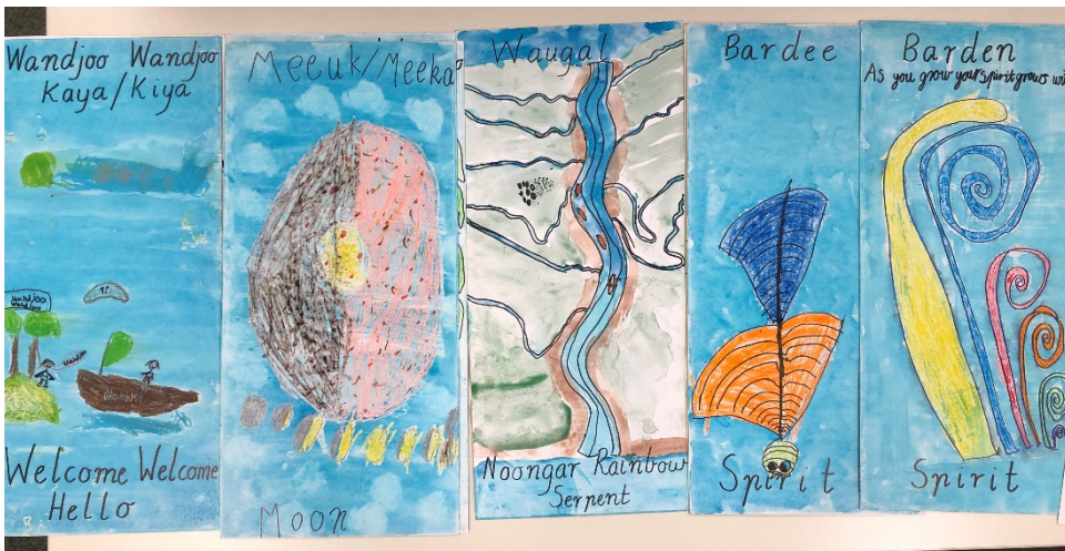
Artwork created by primary school students in response to the banners