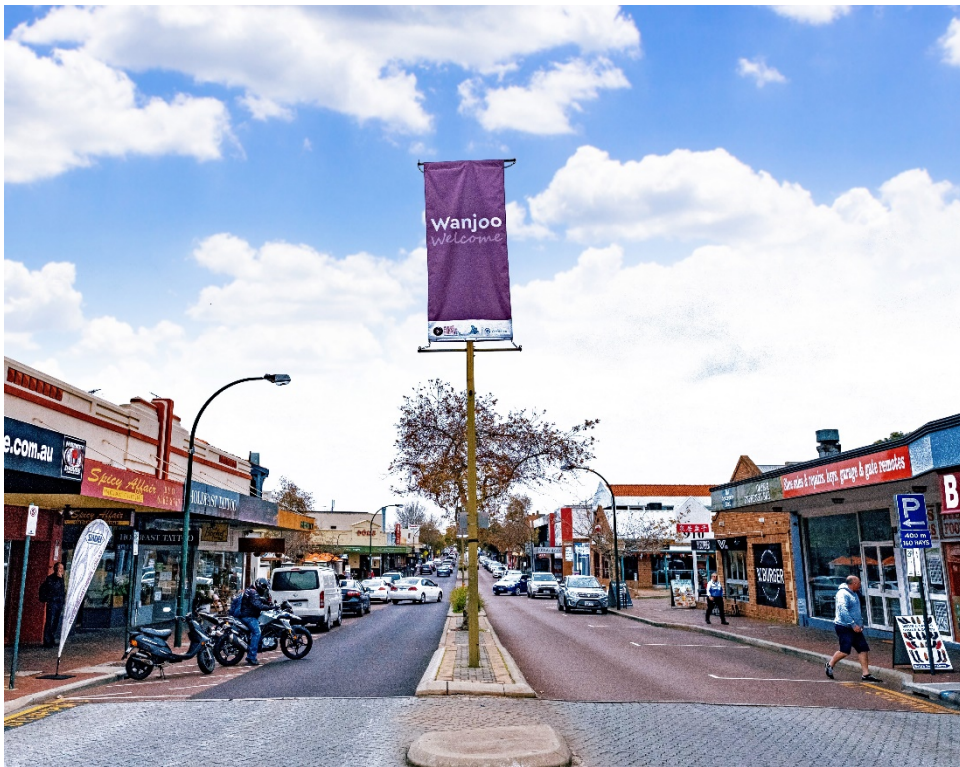
Banners in language