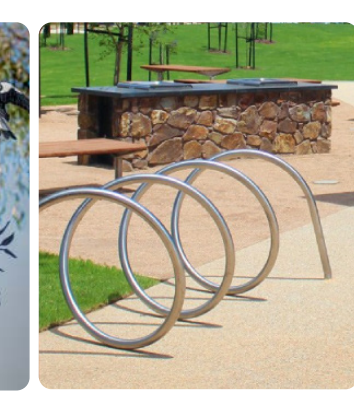
SPIRAL BIKE RACK