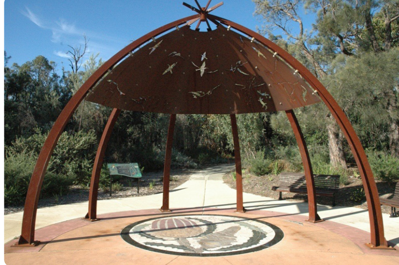
FEATURE SHELTER TO LARGE KNOWLEDGE EXCHANGE AREA